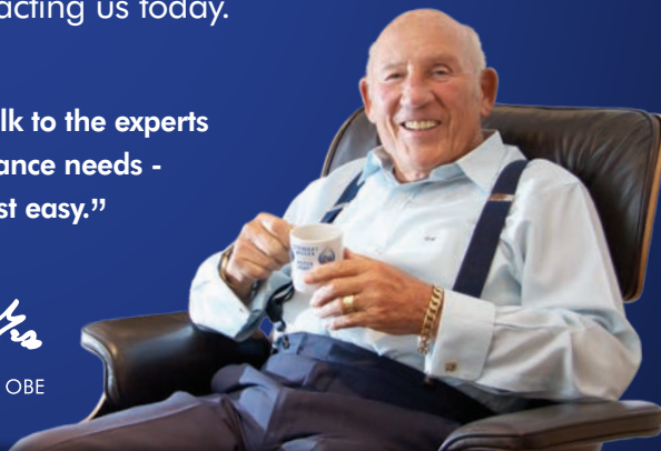
Sir Stirling Moss OBE

"Take my advice and talk to the experts about all your insurance needs - then you can rest easy."