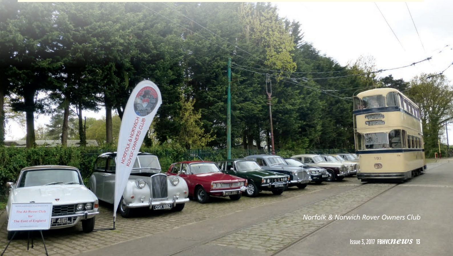
Norfolk & Norwich Rover Owners Club

Eastbourne Historic Vehicle Club A splendid array of motor vehicles assembled for a long drive to Shoreham Airport. The vehicles arranged for the drive range from a 1939 Bedford medium sized truck to various private cars including a Trabant from the former Eastern German Democratic Republic. They were taken on a tour of the airport lasting some 90 minutes taking them conveniently to lunch time.