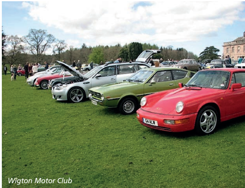
Wigton Motor Club

supported the Poppy Scotland Gathering in Stirling by providing a small exhibition all about the LCP and early pioneers in desert driving.