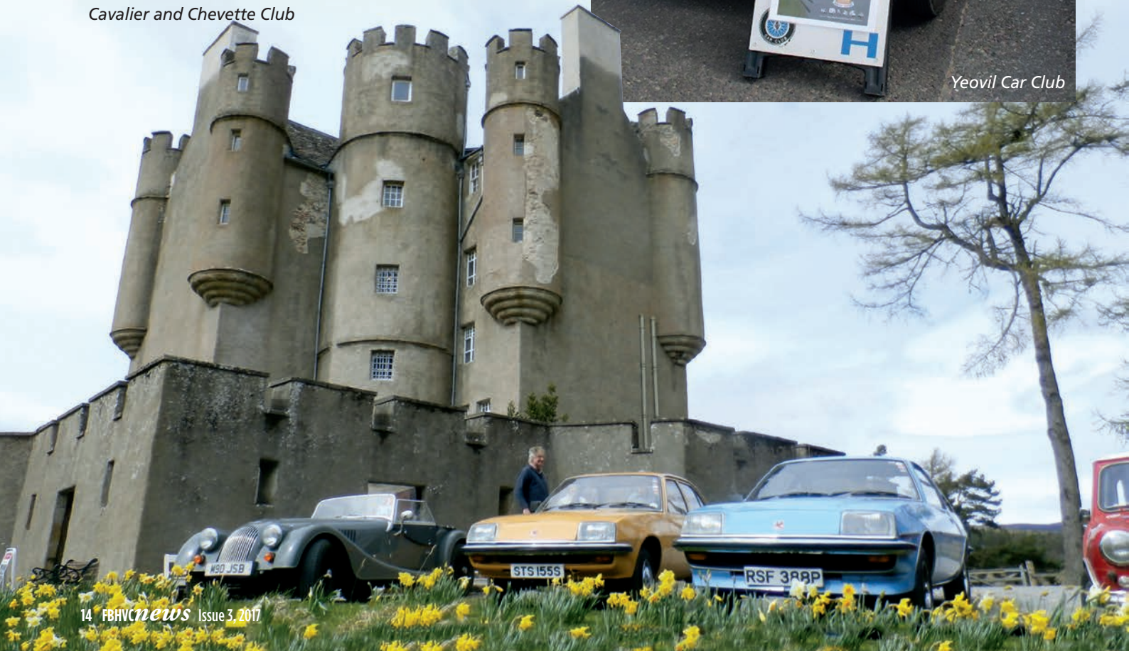
Cavalier and Chevette Club