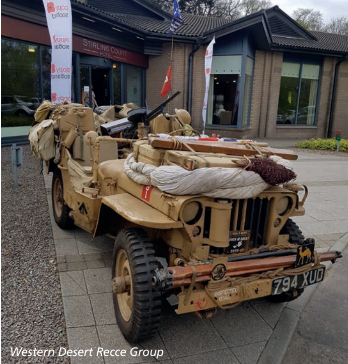
Western Desert Recce Group