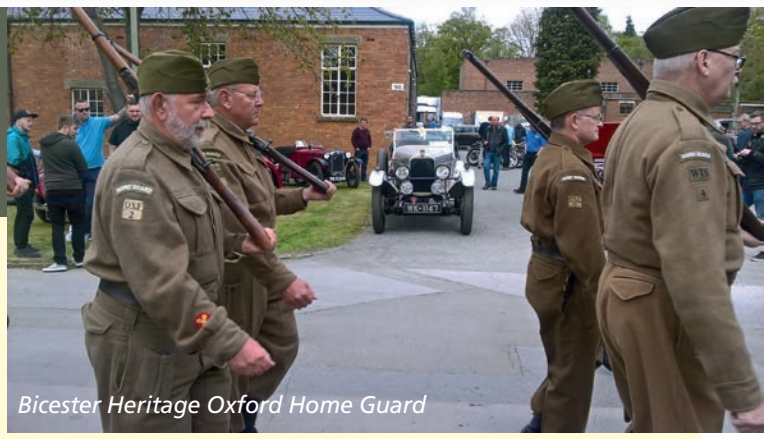
Bicester Heritage Oxford Home Guard

Brooklands had so many historic vehicles attending that they spilled over into the parallel supercar event parking spaces.