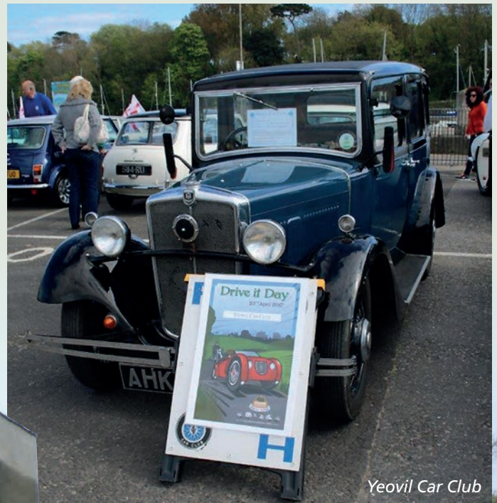
Yeovil Car Club