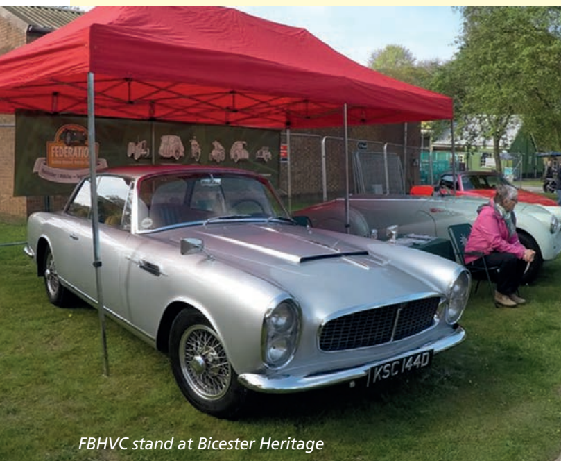
FBHVC stand at Bicester Heritage