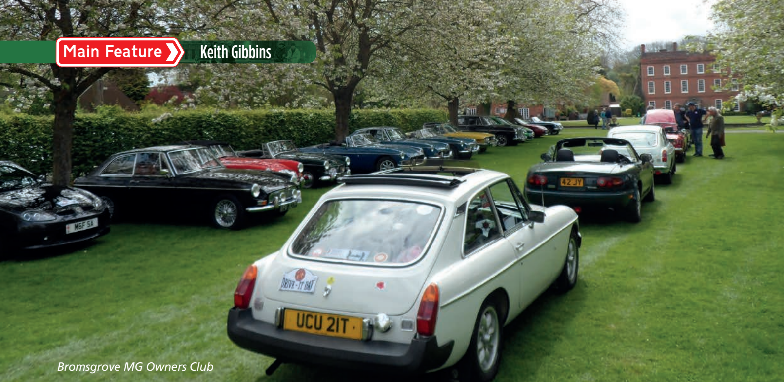
Bromsgrove MG Owners Club

Now that the tour is over, and we who have followed it from day to day can look back calmly upon the incidents thereof and form our own conclusions upon the performances of the cars, it must be admitted that the event has been a decided success. In the first place, seeing the apathy which apparently existed throughout the country upon motor matters, we were distinctly surprised at the enthusiastic welcome accorded the autocarists at every point of the thousand miles, not only in the towns but even in the country villages. That the cars favourably impressed every onlooker can scarcely be hoped for, seeing that, following in each other's dust on dusty days, the occupants presented a decidedly dirty appearance, whilst their leather garments and varied headgear and goggles certainly did not add to their beauty. Apart from appearance, however, there is ample evidence that the public were impressed and impressed favourably, with the wonderful ease of management and the general reliability of the cars.