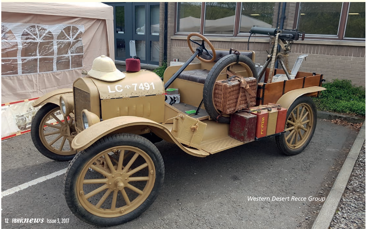
Western Desert Recce Group

Western Desert Recce Group: The photos show a couple of desert vehicles from WW1 and WW2 - a 1919 Light Car Patrol (LCP) Ford Model T and a 1943 Ford GPW jeep in LRDG guise. Over the Drive it weekend they attended and