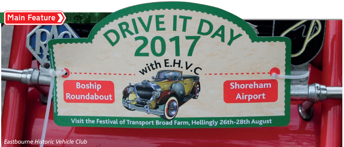
Eastbourne Historic Vehicle Club

Cavalier and Chevette Club: The pictures show Vauxhall Cavalier Mk1. GLS at the Manchester Ship Canal, Ellesmere Port, parked up near the Daniel Adamson steam tug (on the Historic Vessels Register herself). Stanlow Oil Refinery visible in the background, taken at the completion of a 60-mile tour of West Cheshire. The Scottish Highlands area contact organised a multi-marque road run for local classic enthusiasts on the 'Snow Road', the A939 Grantown-Braemar road.